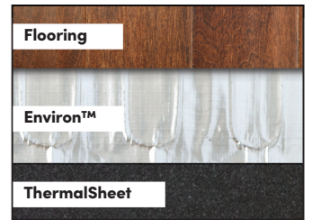
Works with TempZone™ and Environ™ Heating Systems