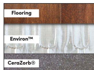
Works with TempZone and Environ Heating Systems