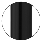
Matte Black Stainless Steel