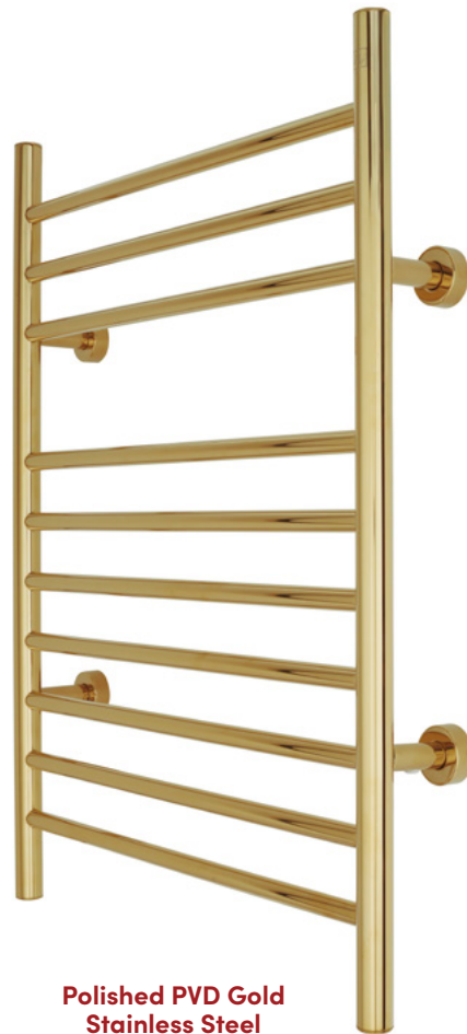
Polished PVD Gold Stainless Steel