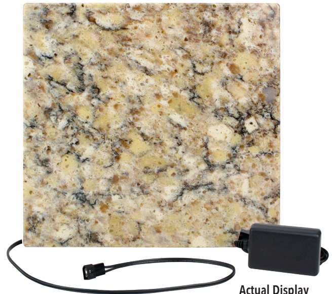
Actual Display (Tile may vary)

* If you wish to get a custom mat for your showroom instead of the display, send us the measurements.